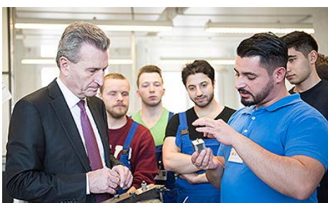
EU Commissioner Günther Oettinger and apprentices, Siemens Training Center, Germany

**The number of times that users have seen posts containing the hashtag, keyword, URL, and/or mention*