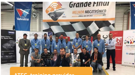
ATEC, training provider, Portugal

Teachers Vocational learners Young people