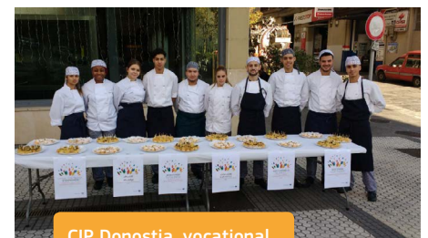
CIP Donostia, vocational school, Spain